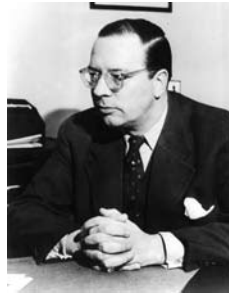
G.F. Duckwitz (1904-73), a long-time Nazi party member, worked for the German embassy in Copenhagen as an expert on maritime issues and was a member of the German intelligence