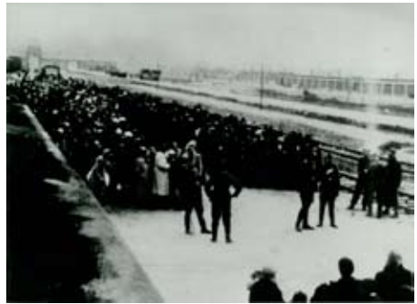
Auschwitz-Birkenau: The largest of all the German extermination camps. A train has arrived carrying Jews. 10-15 % are selected for forced labor, the rest are sent directly to the gas chambers.

perpetrators and collaborators from many occupied countries were involved.