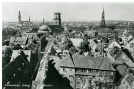
Copenhagen, Denmark's capital and largest city by far, was the center of Jewish life and culture. The Synagogue from 1833 is at the far right edge of this photo, within walking distance of the University, City Hall and Lutheran Cathedral.

Denmark saw little of the radical class divisions that polarized many societies during the inter-war period. Like today, the standard of living was among the highest in the world. In many ways the Danish people were highly privileged and steeped in self-complacency.