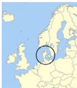
Denmark: 43,000 km2 of islands and one peninsula bridging Scandinavia and the European continent.