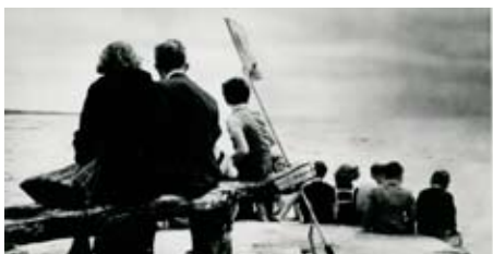
Homesickness: the Danish coast was visible from Sweden. There were many children among the Jewish refugees -- over 1,000 under the age of 10.

For Sweden, sheltering the Danish Jews meant a turn away from a compliant policy toward German rulership. It wasn't long before the underground army, built up by the Danish resistance began receiving weapons illegally from Sweden, and Danish exile forces, 'The Danish Brigade', were trained in Sweden for deployment in case of a German collapse and possible Communist revolt (which Stalin's Danish followers actually never contemplated).