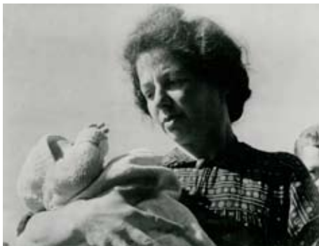
Arriving in Sweden -- safe at last

fact that German sources leaked a warning about the impending deportation. But above all, it was the ingenuity and will of many people wanting to protect an oppressed minority that guaranteed the successful outcome.