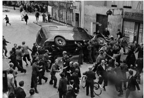
The ‘August Uprising’ is also directed against the Danish authorities’ compliance with the occupying power. Here, a Danish police vehicle is overturned by protesters during the general strike.