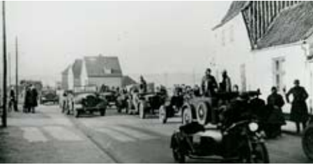
The Danish military was powerless in face of the modern German offense.