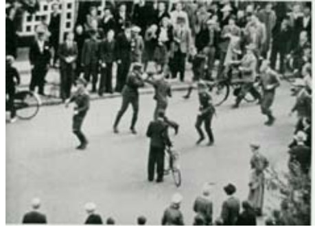
August 1943: the funeral of an executed saboteur in Aalborg develops into a mass gathering, and demonstrators boldly assault German soldiers.

The actual commencement of the operation was postponed somewhat, probably because the Germans wanted to end ongoing trade negotiations on next year’s Danish supplies to the Reich first. On October 1, 1943 they were brought to an end, and on that very evening the operation began.