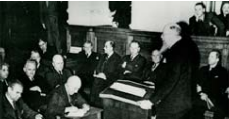
Prime Minister Thorvald Stauning addresses Parliament April 9th, urging calm and composure.