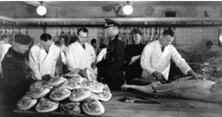
German inspectors at a Danish export slaughterhouse: Denmark became an important part of the German war economy and was able to gain political maneuvering space. The need for supplies and racial considerations motivated the moderate German occupation policy 1940-45.